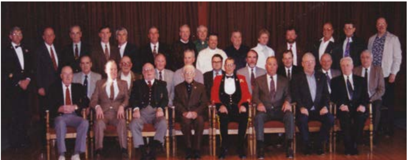
1994 Association Gathering.